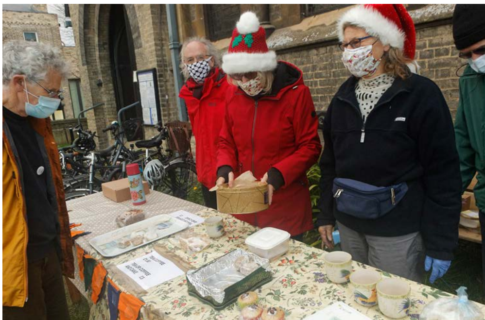
The Winter Fair was our first time real world event since the pandemic began

By December we could meet again and, despite covid restrictions and a rainy start to the morning, we saw a good turnout for our winter fair at St Giles Church. The sun did eventually break through, and visitors enjoyed stalls selling hot drinks, homemade cakes, crafts made by refugees in Greece, Christmas cards and CamCrag ponchos. We also held a raffle for a magnificent hamper, and in total raised £1,256. Thank you to everyone who contributed their time, talents, crafts and cakes.